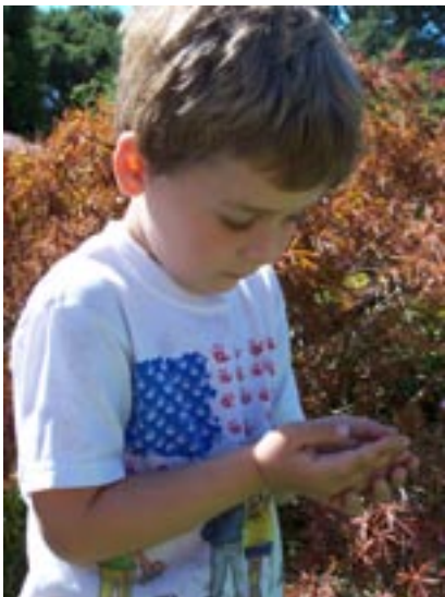
Worm composting is a great way to get students interested in waste reduction.

The secret to a great spring garden is to start preparing your soil and your students now! Fall is the best time to prepare the garden soil for spring plantings. Mulching your garden plot is an excellent way to get started in preparing both large and small gardens. Another key step is to start a classroom worm bin during the fall so that the worms and their pals will have sufficient time to produce an abundant supply of the best plant food around- worm poop!